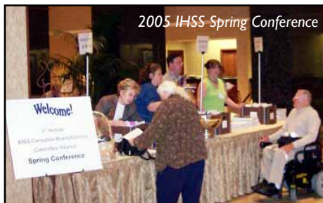
2005 IHSS Spring Conference

will feature hors d’oeuvres, hosted non-alcoholic beverages, and a no-host bar. It’s a great time for you to relax and unwind while you network with other conference associ-