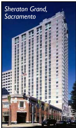
Sheraton Grand, Sacramento

will feature hors d’oeuvres, hosted non-alcoholic beverages, and a no-host bar. It’s a great time for you to relax and unwind while you network with other conference associ-